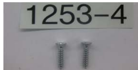
1253-4 SCREW #8 X 7/8 PHIL FLAT ZINC