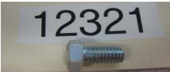
12321 SCREWS FOR HINGES