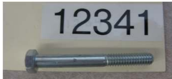
12341 Bolt attaches bottom of lower cylinder to the cylinder bracket