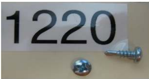
1220 SCREWS FOR ATTACHING THE LATCH