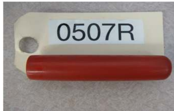
0507R RED HANDLE FOR HOLD OPEN ARM