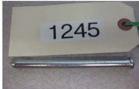
1245 PIN HINGE