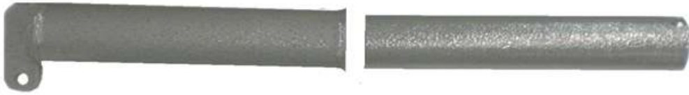
RHG050 (2013 GEN 3 Style Cylinder & Used for Retrofits on GEN 2)