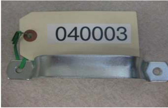
040003 INSIDE DOOR HANDLE