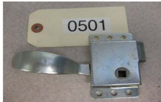
0501 LATCH FOR DOOR