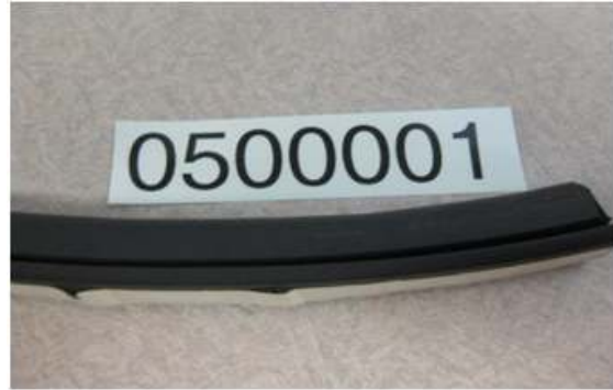
010001 GASKET FOR LID/PER FOOT