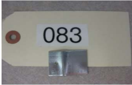
083 CLIPS FOR HOLDING THE DOOR GASKET