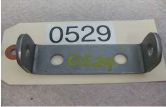
0529 2 PER UNIT. BRACKET HINGE OUTSIDE