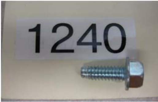
1240 Self-tapping bolts hold cylinder bracket to lid and hold hat bracket to side wall