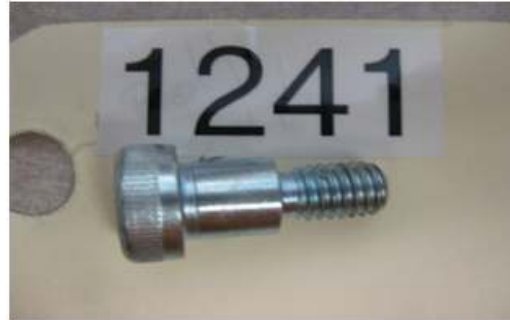
1241 BOLT TO ATTACH THE RED LEVER