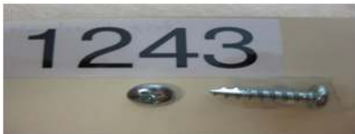
1243 SCREWS FOR INSIDE DOOR HANDLE