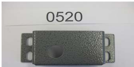
0520 BRKT LATCH MOUNTING TO DOOR