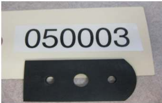
050003 GASKET FOR HANDLE