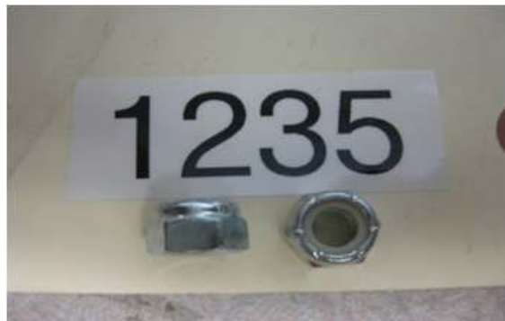
1235 NUTS FOR SHOCKS BRACKET