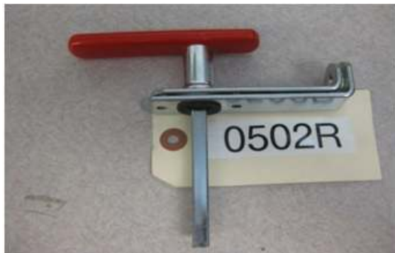
0502R OUTSIDE HANDLE