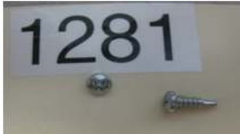
1281 SCREWS FOR GASKET CLIPS