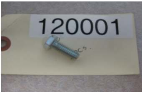
120001 Bolt attaches lower hold-open arm to bracket See Nut 1235 also